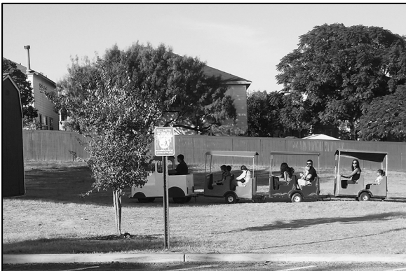
Children (and parents) riding the train.