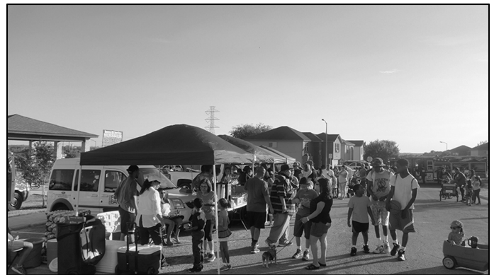
Waiting for yummy food.