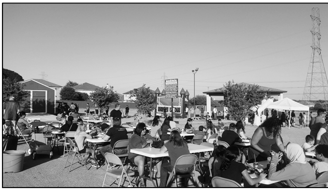
Bridgewood residents enjoying NNO 2015.