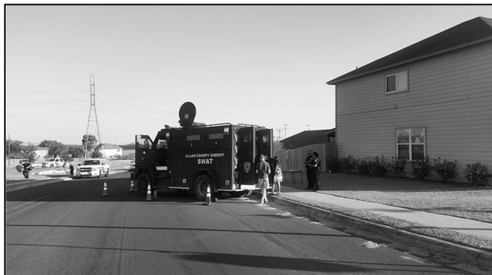
Bexar County Sheriff's Office SWAT.