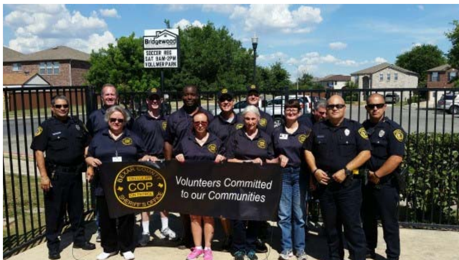
Bridgewood COP Blitz Volunteers